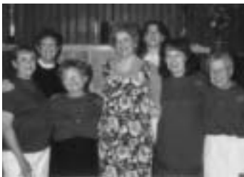
The Dorothy Day chapter at St. Charles Episcopal Church in Ft. Morgan, CO, celebrated its first anniversary by admitting a new member, installing new officers, and rededicating themselves to the Lord and

His work, during a Sunday morning Eucharist at the end of August.