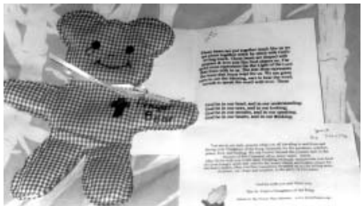
One chapter made Prayer Bears—including a prayer for safe travel—for those traveling to Triennial Convention.

Our individual and communal ministries are strengthened by what we learn and share with each other. The reason we come together at meetings is to form community and continuity in our purpose. Through study, prayer, service and evangelism we seek to assist, For His Sake.