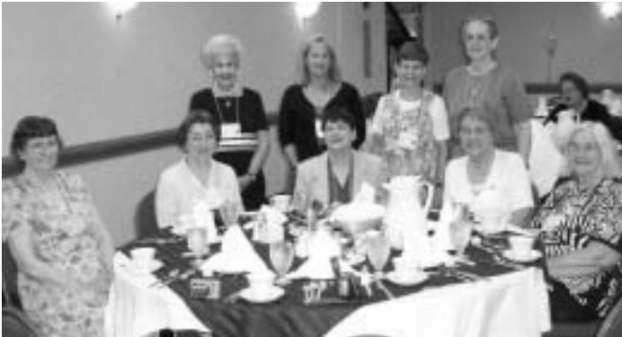
Sr. Daughters from Province I who attended Triennial in July are pictured above at their Province Banquet.