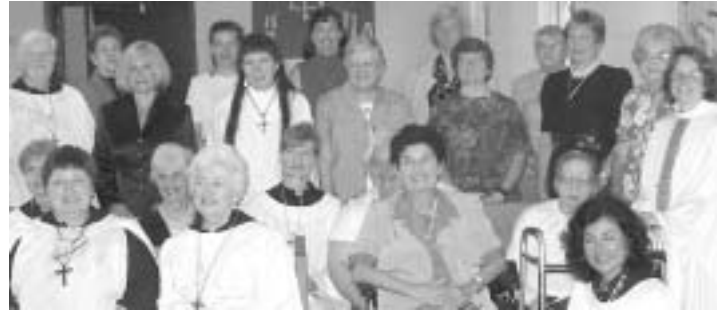
A new chapter was installed at St. James Episcopal Church, Roanoke, VA, this summer. Named The Shepherdesses, the chapter has 22 members.