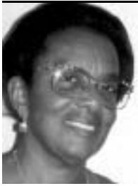
Geraldine Sweeting Evangelism