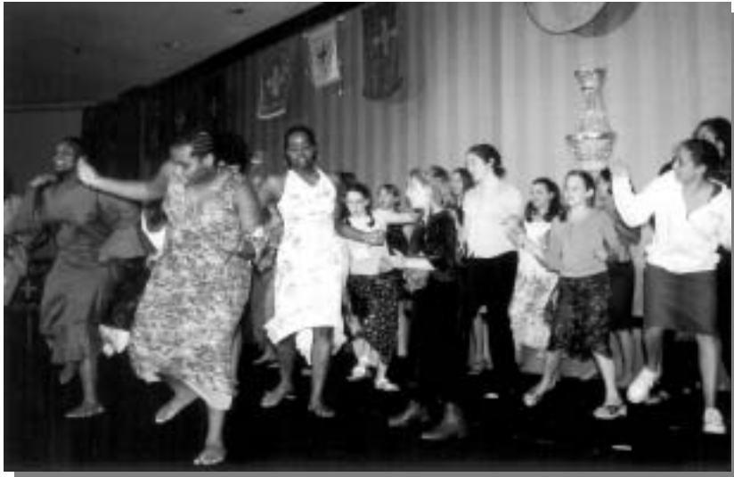
Junior Daughters entertained at the Triennial Banquet with several skits and dancing.